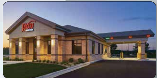
Celebrating the addition of: WCCU Portage & WCCU Mobile Branch